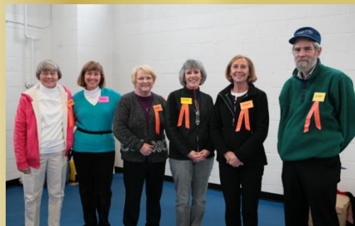
Volunteers at the 2012 Save Your Breath walk

All proceeds will support Free ME from Lung Cancer's mission – research, education and community support.