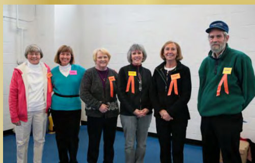
Volunteers at the 2012 Save Your Breath walk

All proceeds will support Free ME from Lung Cancer's mission – research, education and community support.